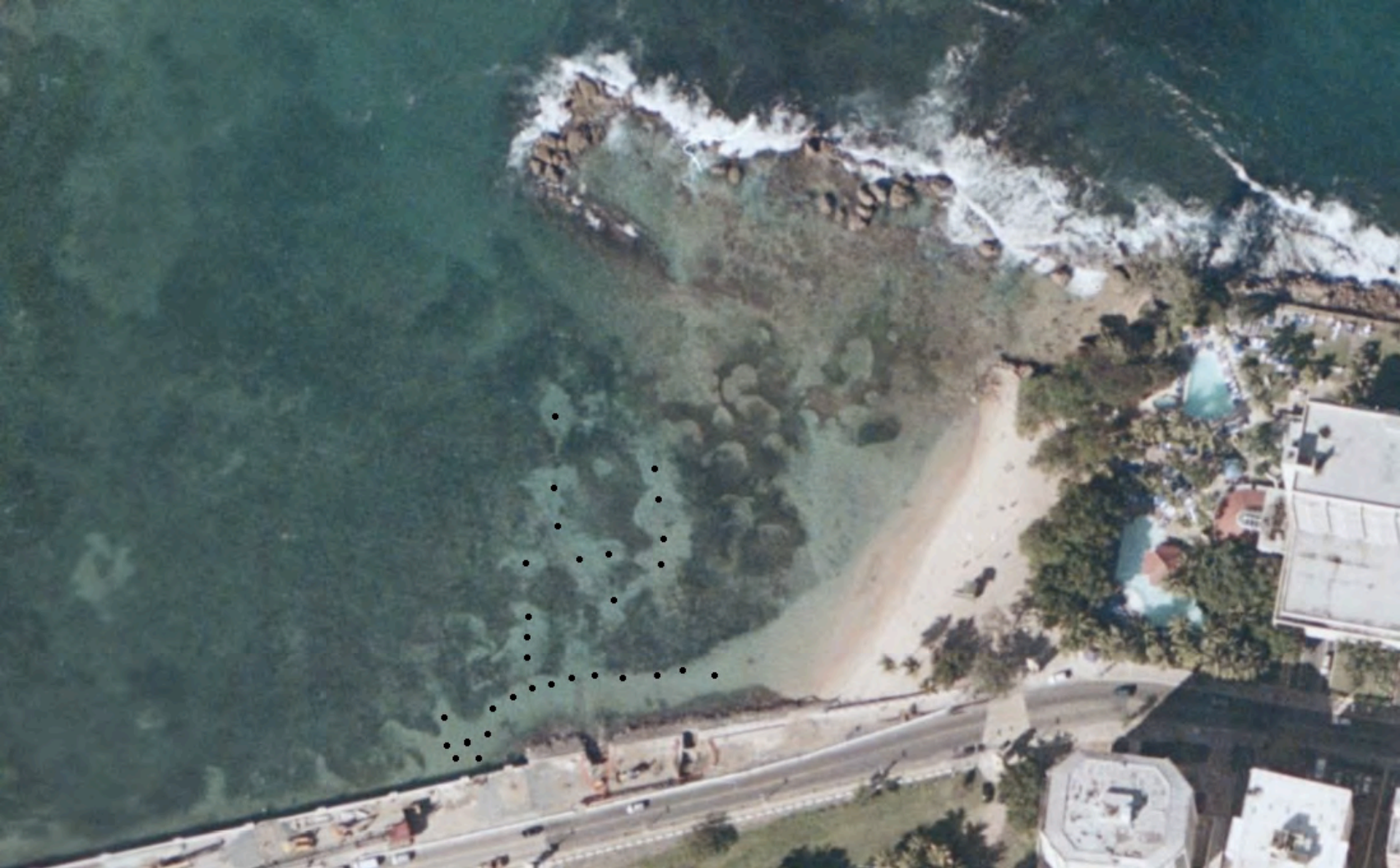
Condado Lagoon underwater trail location