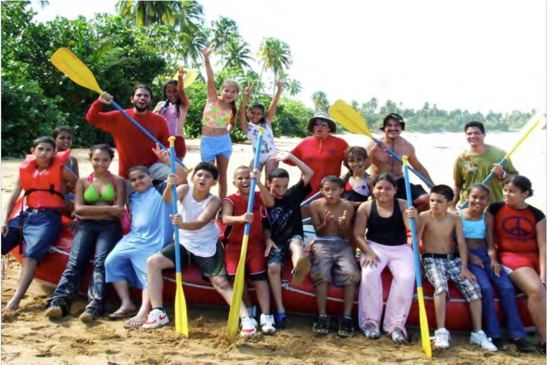
San Juan Bay Estuary Program Urban Waters Conference, DC, 2016