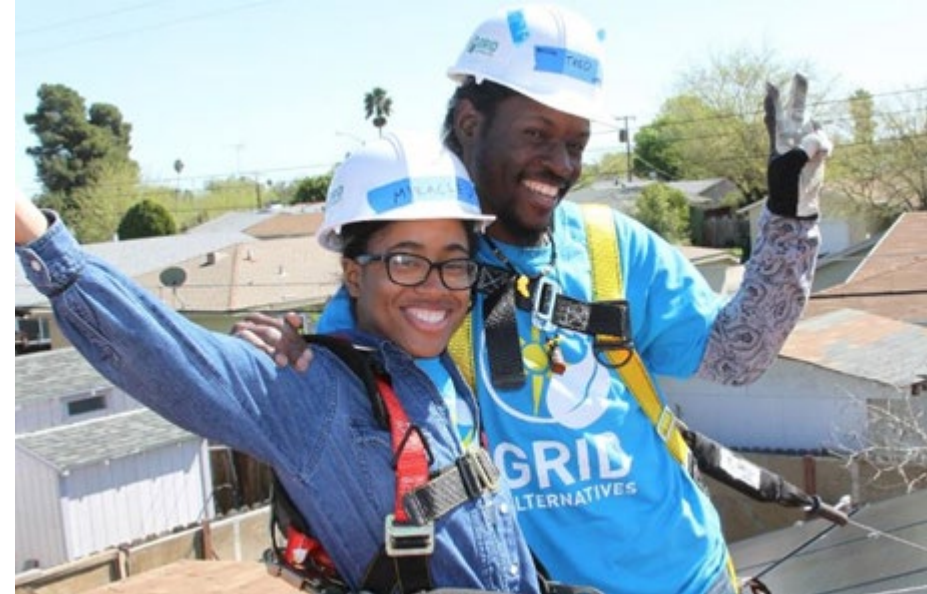
Collegiate Network & Solar Spring Break